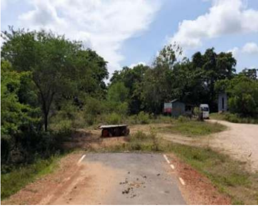
From LB Side