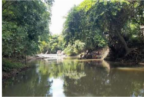
From D/S Side