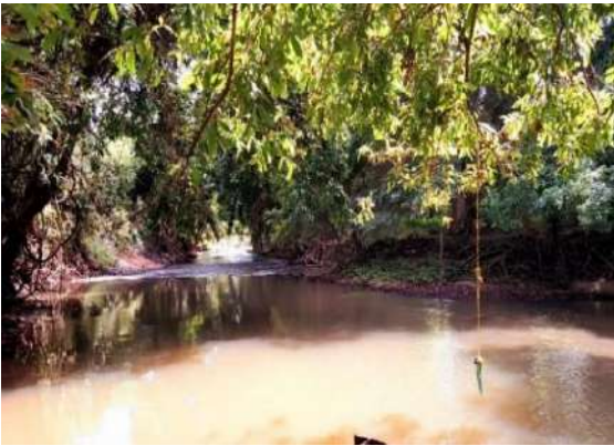
From U/S Side