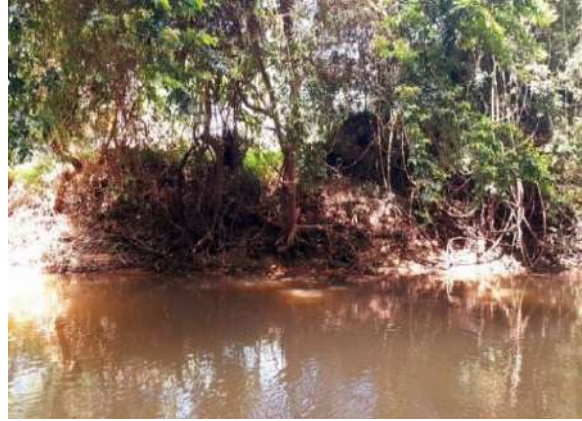
From RB Side