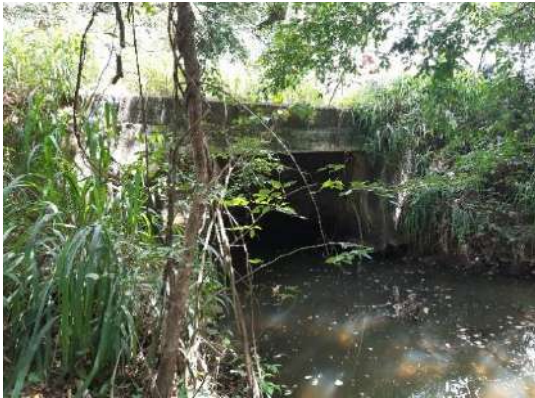
FROM D/S SIDE