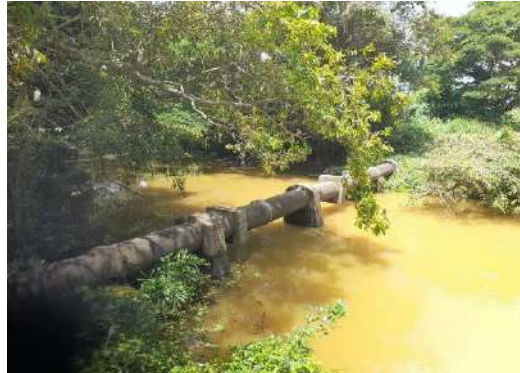
FROM RB SIDE