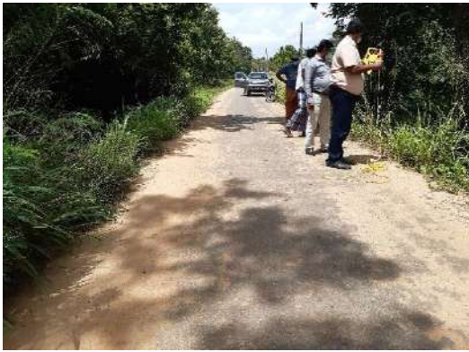
FROM LB SIDE