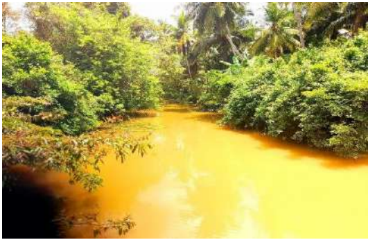
FROM U/S SIDE