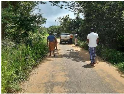
FROM RB SIDE