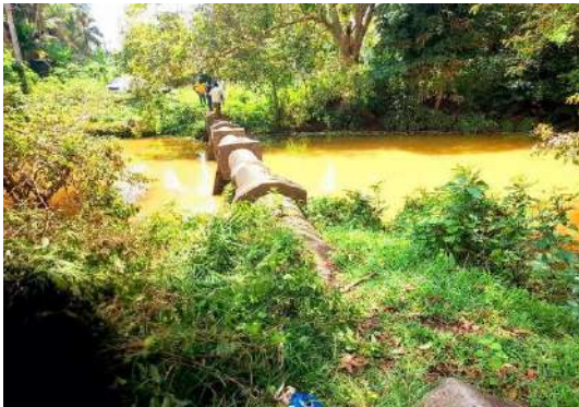
FROM LB SIDE