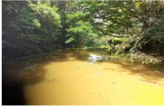
FROM D/S SIDE