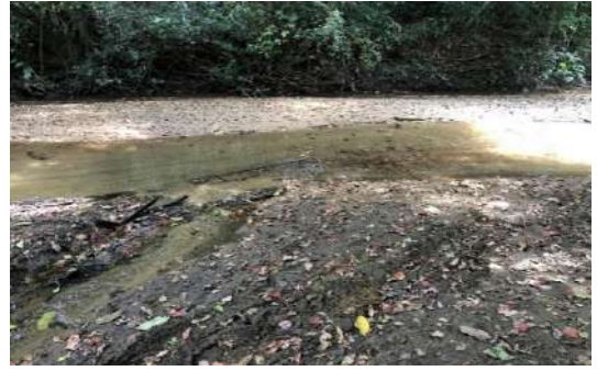
From RB Side