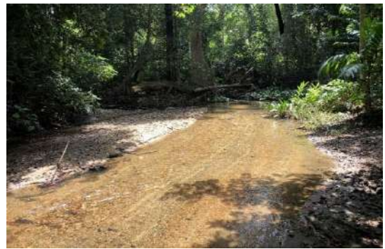
From D/S Side