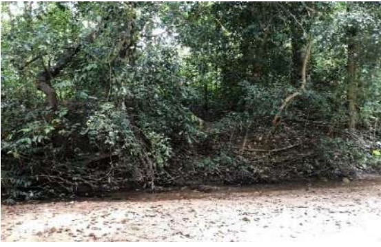
From LB Side