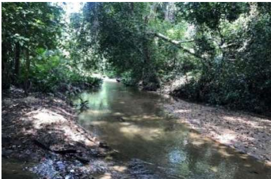
From U/S Side