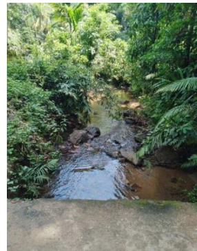
From D/S Side

District – Kegalle DS Division – Daraniyagala