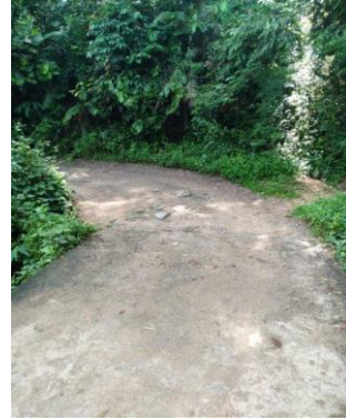
From RB Side RB - Pahala miyanawita