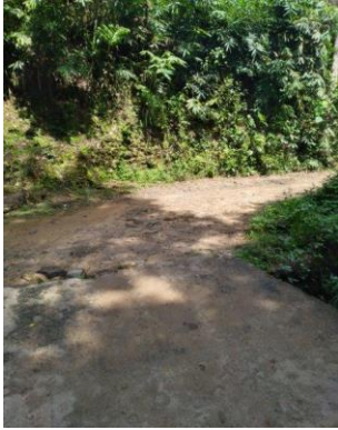
From LB Side LB- Beligaswaththa