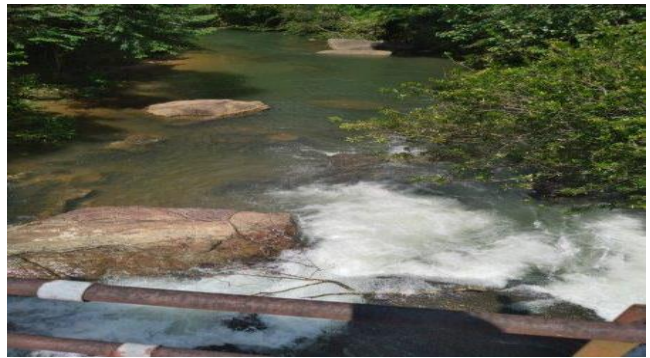
From D/S Side