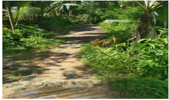
From RB Side RB - Pallekanda