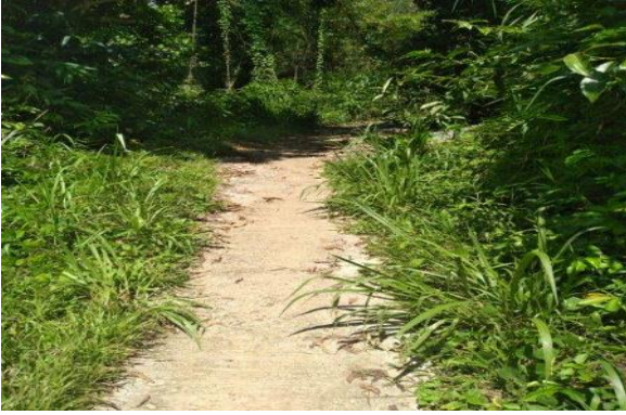
From LB Side LB- Egodokkanda